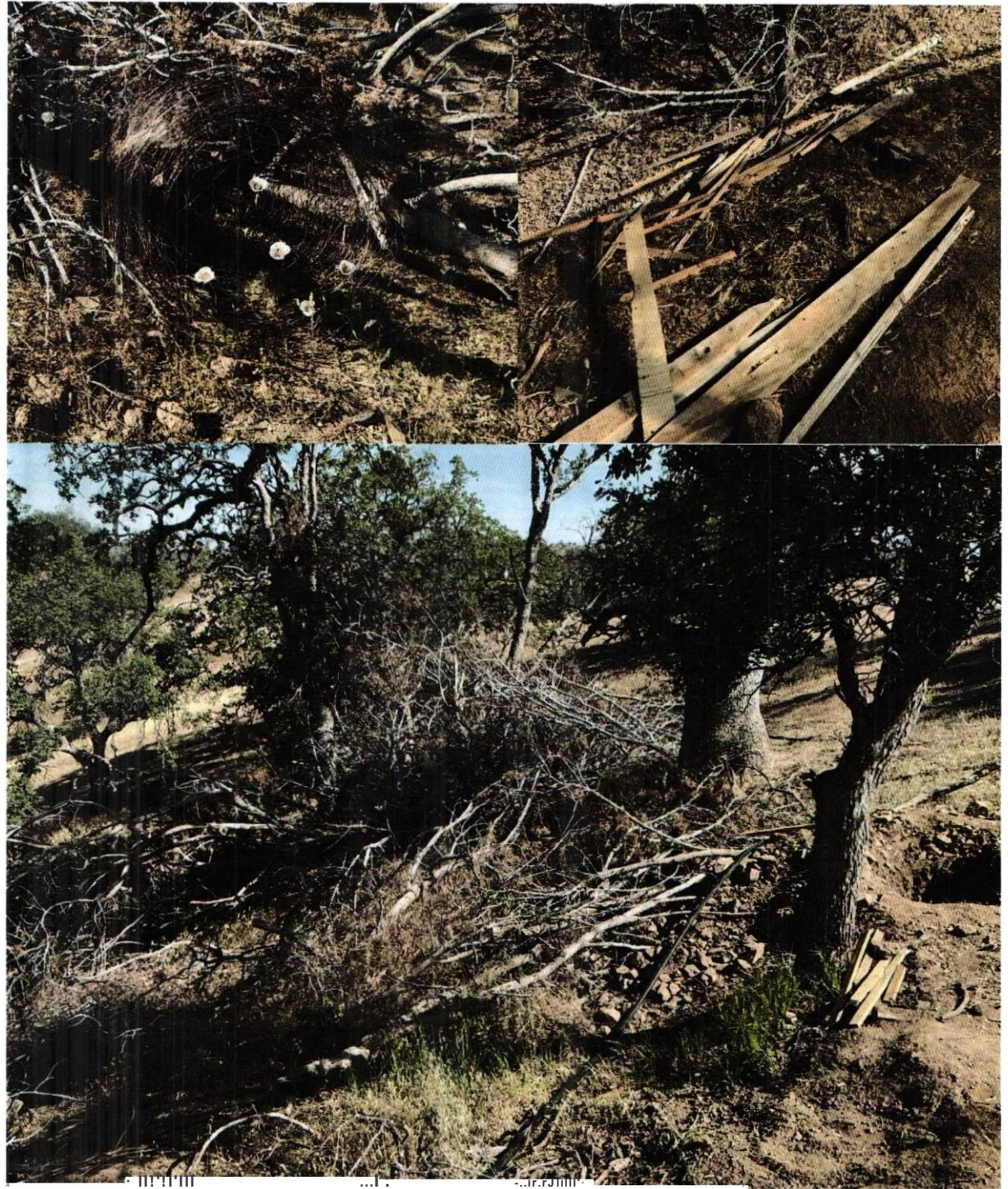
Photo #9, 10, & 11, Site ID "MPG-1". Trash and debris such as rusted fence wire, plastic irrigation line, treated lumber, large amounts of slash and cut trees. All placed in the direct path of the ephemeral stream causing sediment delivery and erosion.

Jose S. Lopez Jr. July 20, 2022 Page 15 of 18