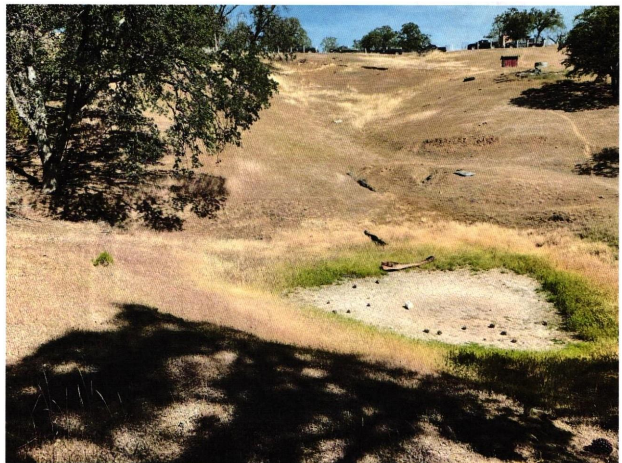
Photo #6, Site ID "PP-6". Placement of tire, metal siding, plastic buckets, other household trash and miscellaneous debris in stream channel and onstream reservoir.