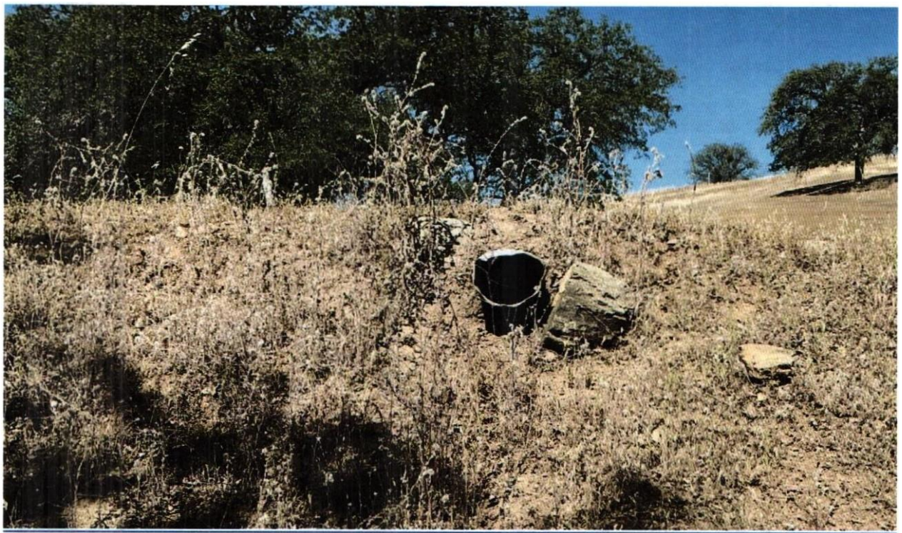
Photo #2, Site ID "HAPt-1". Undersized, poorly aligned, and broken culvert serving as overflow pipes perched above the stream resulting in sediment erosion.

Jose S. Lopez Jr. July 20, 2022 Page 9 of 18