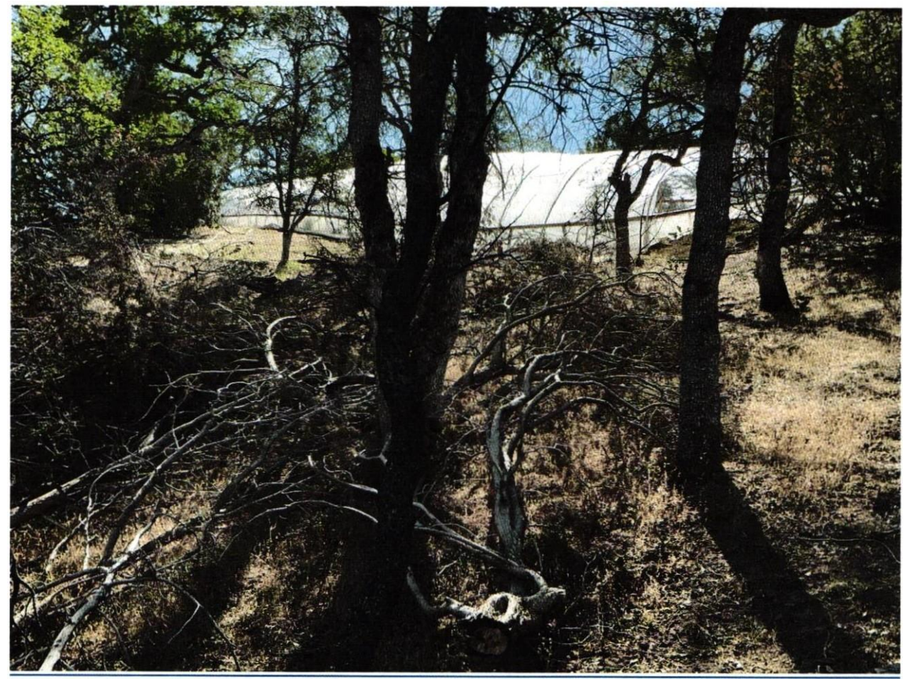
Photo #8, Site ID "HAPt-2". Grading and obstruction of natural stream flow occurred to construct a flat surface for cultivation in an unnamed tributary to Arroyo Mocho.

Jose S. Lopez Jr. July 20, 2022 Page 14 of 18