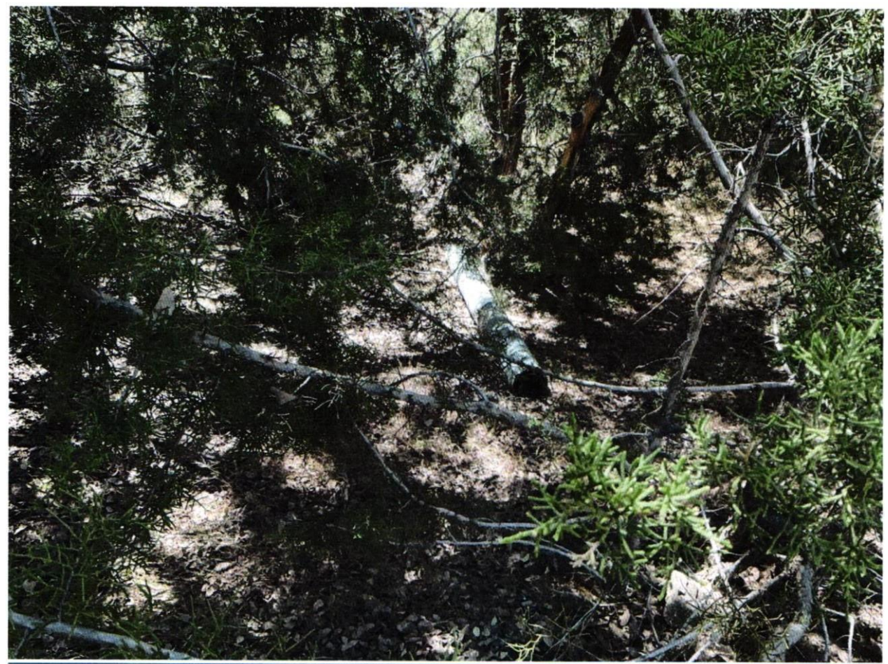
Photo #3, Site ID "MP-4". Five feet of broken off corrugated piping that is the result of a misaligned overflow pipe that was perched above the stream. Broken off piping deposited within 50 ft of waters of the state.

Jose S. Lopez Jr. July 20, 2022 Page 10 of 18