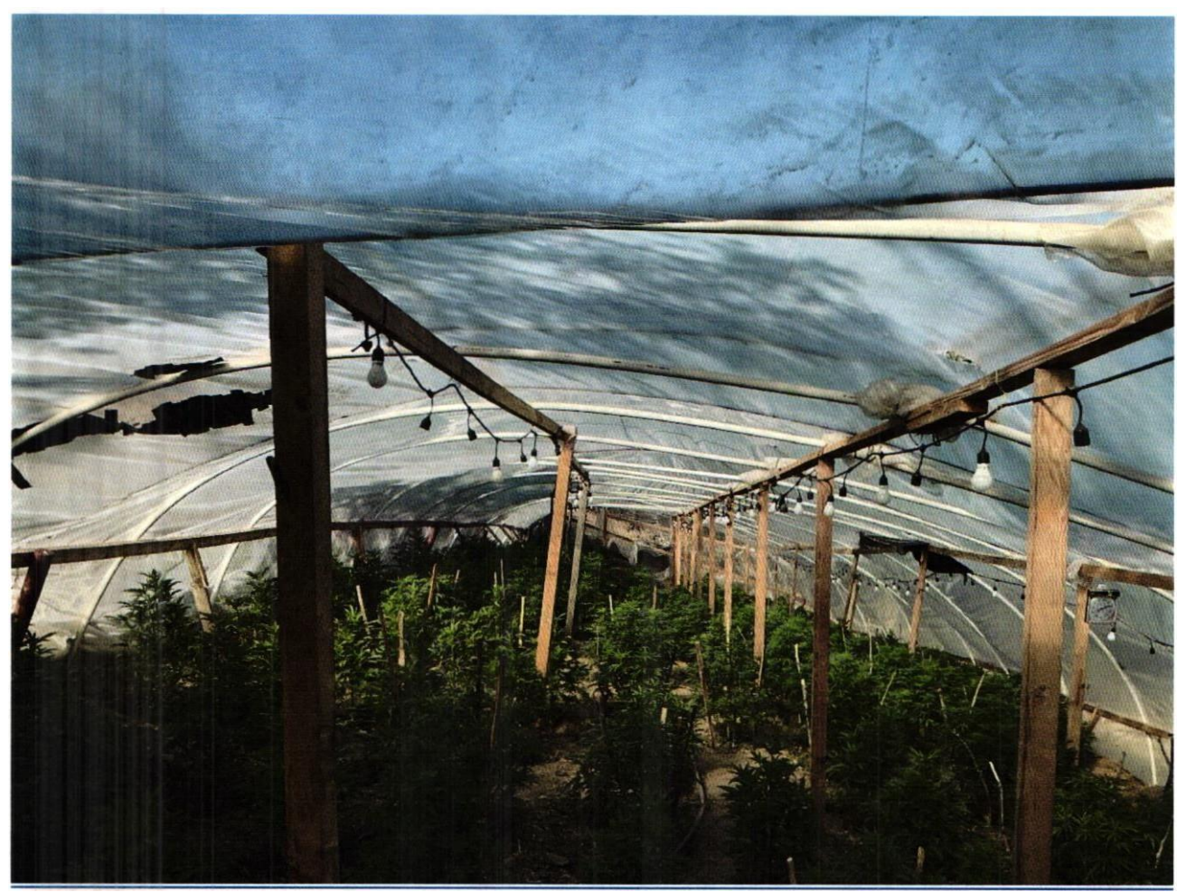
Photo #7, Site ID "HAPt-2". Approximately 900 linear feet of ephemeral tributary to Arroyo Mocho was graded for the construction of 4269ft<sup>2</sup> cultivation pad.

Jose S. Lopez Jr. July 20, 2022 Page 13 of 18