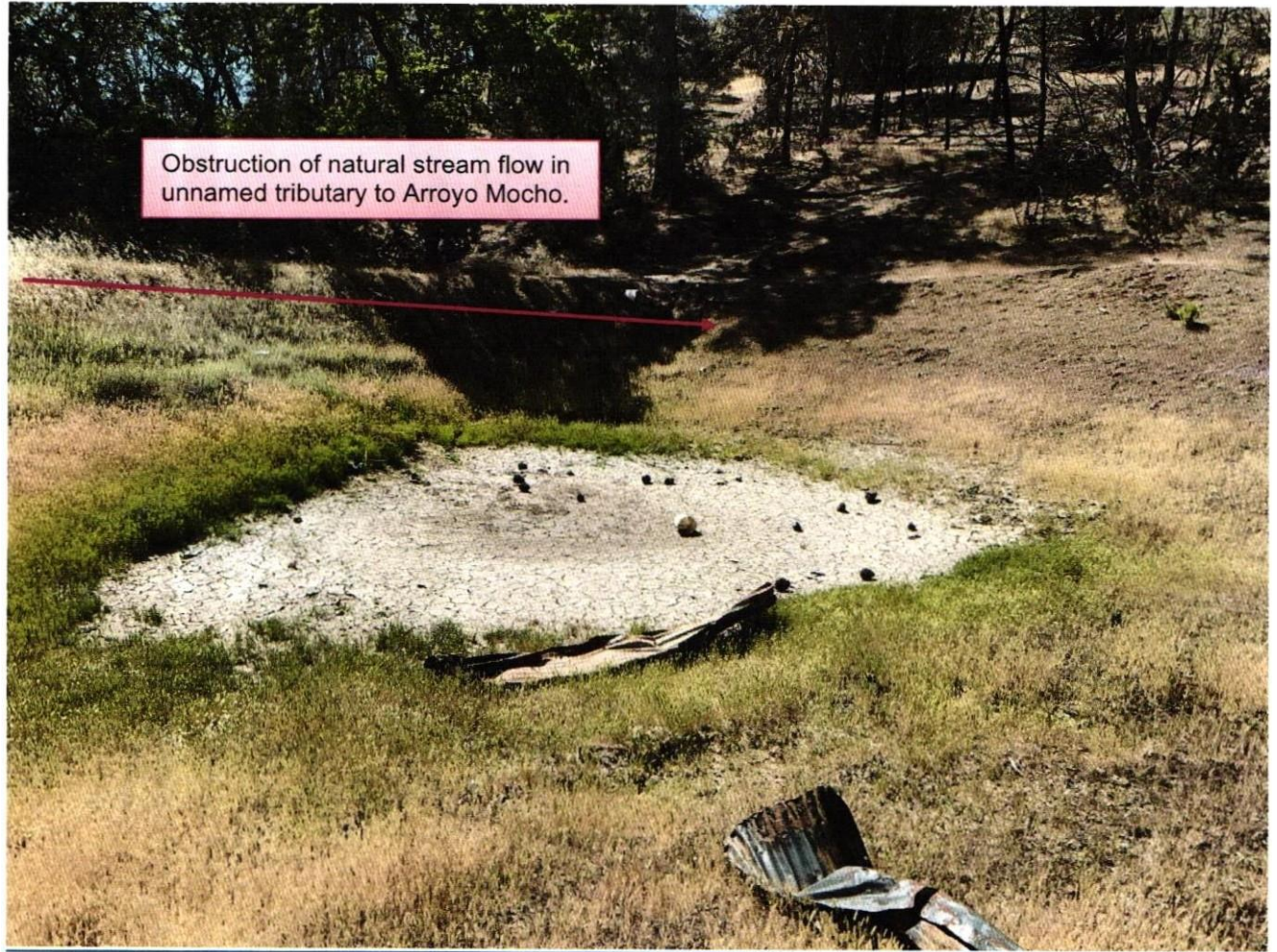
Photo #1, Site ID "HAPt-1". Construction of a dam, placement of fill, and obstruction of natural stream flow in an unnamed tributary to Arroyo Mocho. Creation of onstream reservoir due to obstruction of natural stream flow.

Jose S. Lopez Jr. July 20, 2022 Page 8 of 18